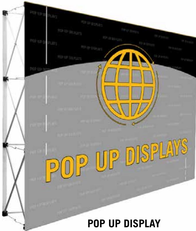
POP UP DISPLAY