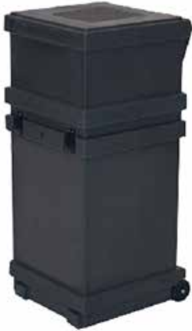
HARD SHELL ROLLER CASE