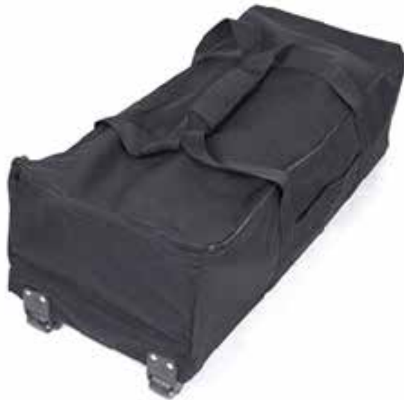
SOFT SHELL ROLLER CASE